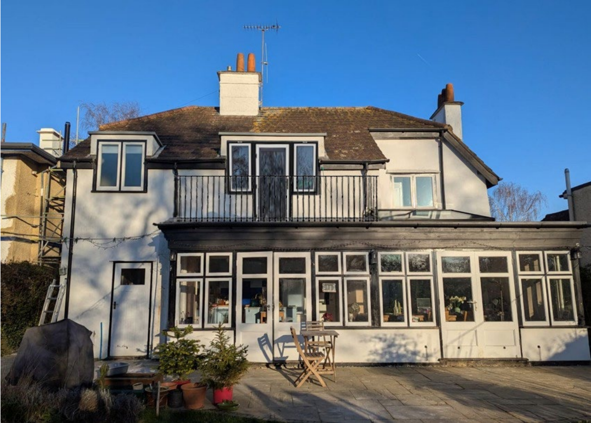
Impression of the rear elevation