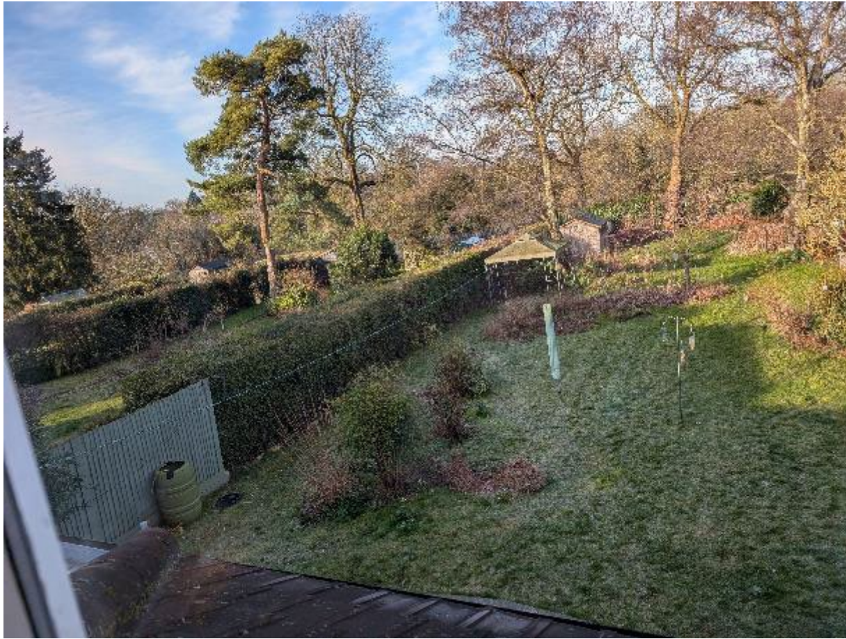
A view towards number 1 from existing master bedroom window; addition of a balcony replacing the roof (which can be seen in the photo) would not mean any additional “overlook” of neighbouring garden.