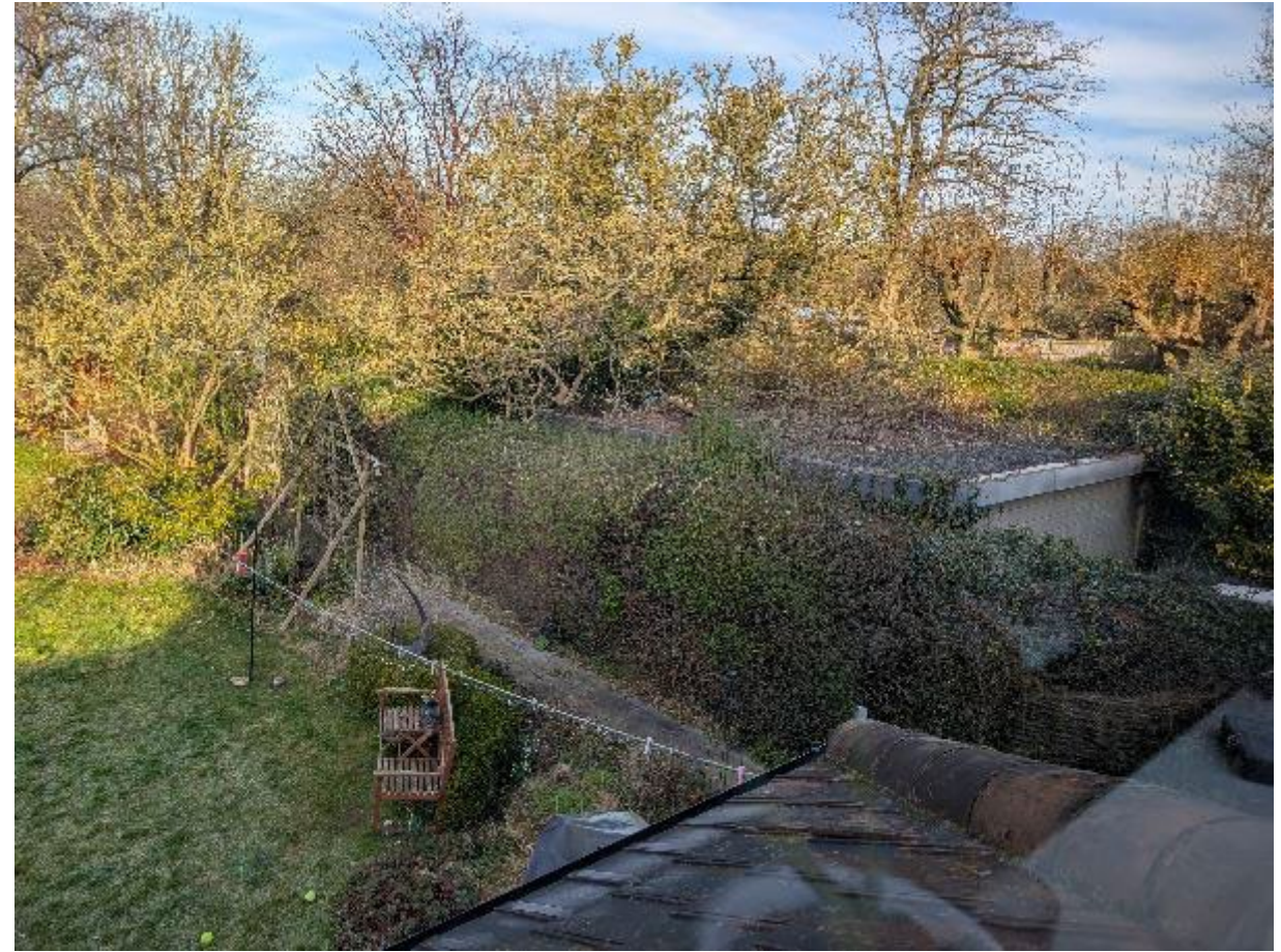
A view towards number 1 from existing master bedroom window; addition of balcony replacing the roof (which can be seen in the photo) would not mean any additional “overlook” of neighbouring garden.